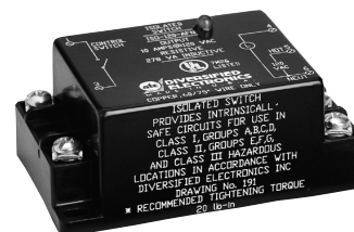
Single Channel Isolated Switch

Process Control Equipment for Hazardous Locations 7M26 UL913