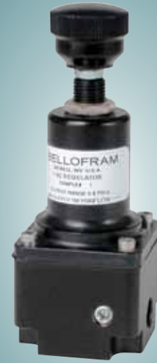
Type 92 Subminiature Regulator Series

The Type 92 Subminiature Regulator is a compact, low-cost unit which operates in pressure ranges up to 100 PSI, with a maximum supply pressure of 150 PSI. It provides dependable reliability and accuracy for low flow or dead end applications. The Type 92 subminiature regulator is available with a corrosion resistant anodized aluminum body and bonnet. Comes standard with a fluorocarbon diaphragm.